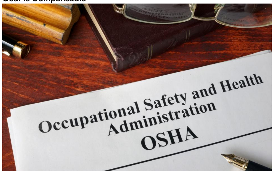
Contested Safety Citation Struck Down as OSHA Fails to Make Its Case