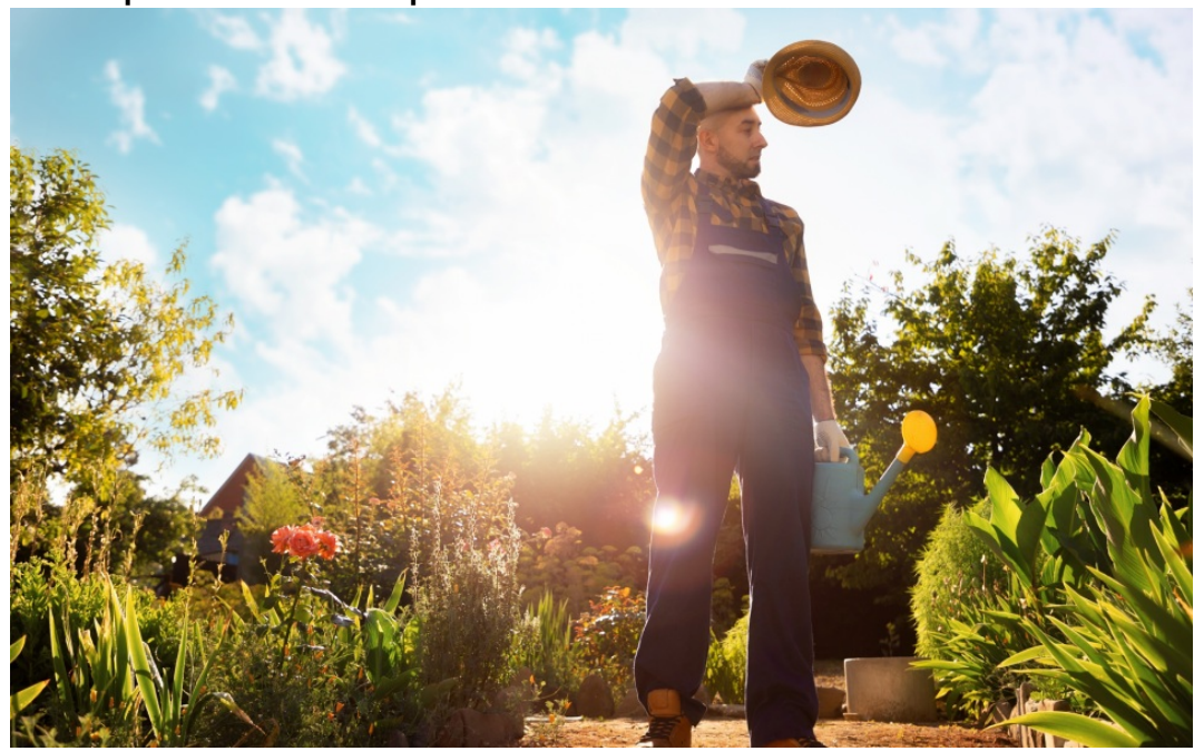
OSHA Advancing Indoor and Outdoor Heat Illness Rule with Small Business Review