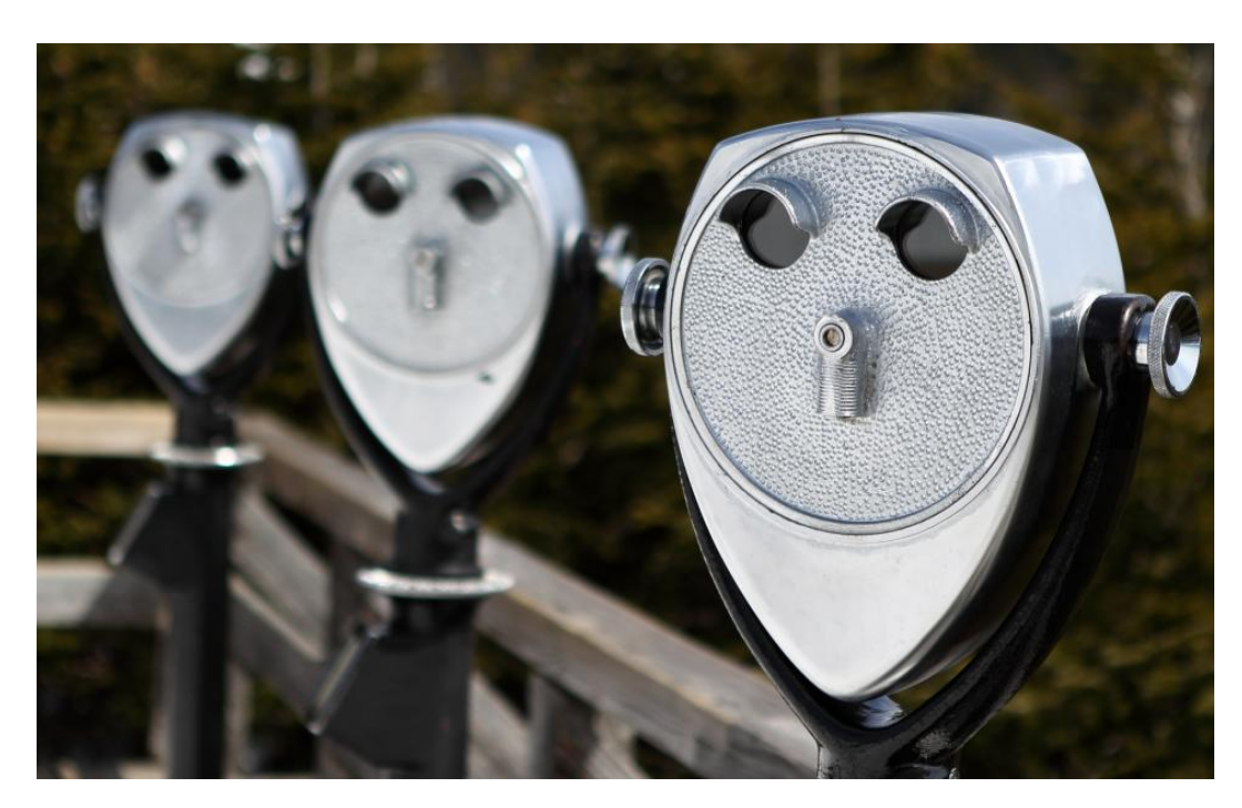
DOL Proposes Allowing Union Representatives, Others to Participate in OSHA Inspections: What It Means