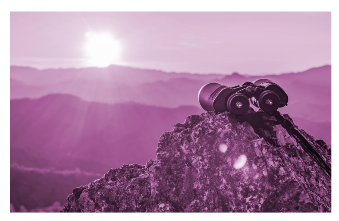
2023 Mid-Year Report: OSHA Update