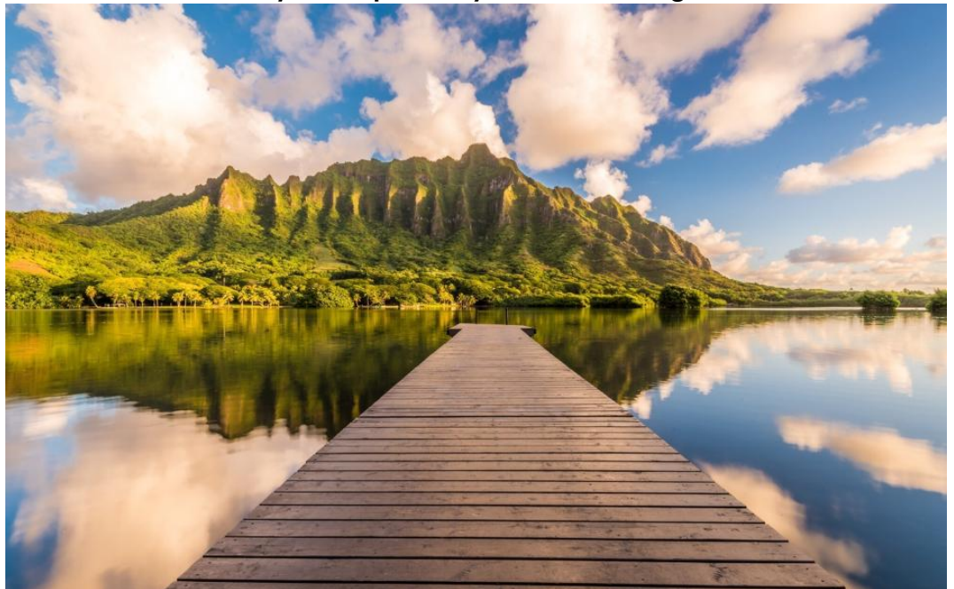
Hawaii Enacts Pay Transparency Law