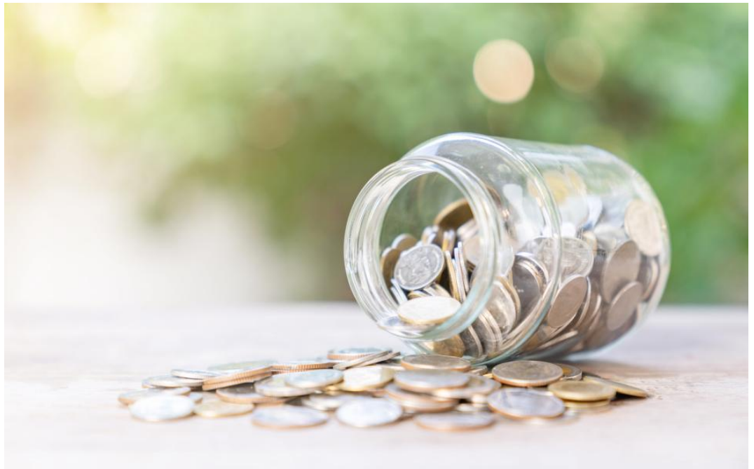
Illinois Mandates Pay Transparency in Job Postings