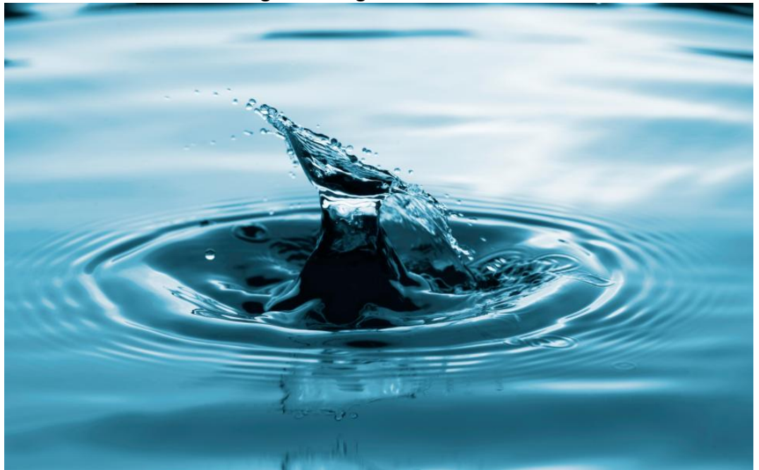
Initial Ripple Effects of U.S. Supreme Court Affirmative Action in Student Admissions Decision