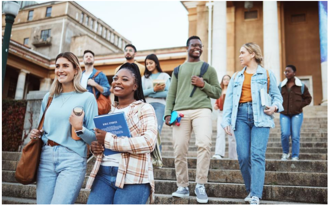
U.S. Department of Education Office Publishes Guidance on Race in Admissions, School Programming