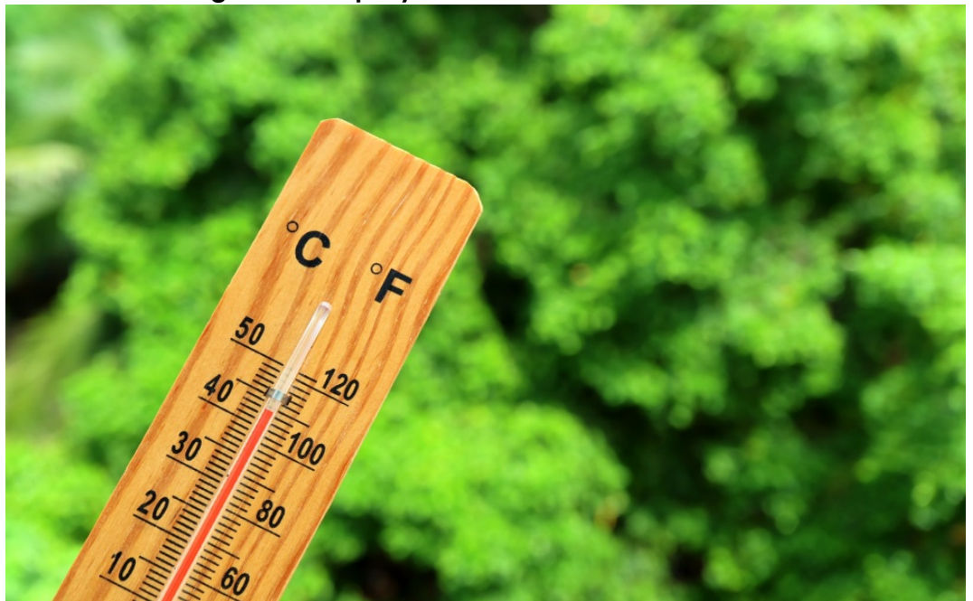
ESG: Utilizing the Framework to Address Employee Concerns and Safety Needs