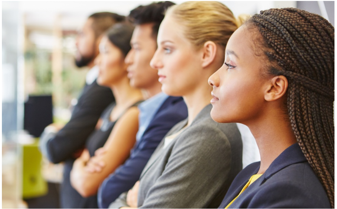
ESG: Promoting Racial Equity