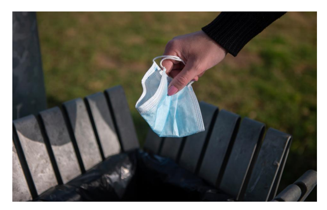
The National Emergency Ends . . . But Wait, There's More!