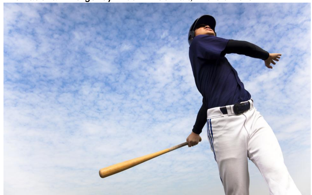
Going to Bat for Hiring a Great Benefit Plan Auditor