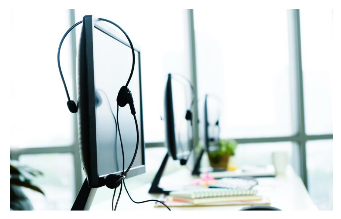
DOL Issues Guidance on Handling Telework under FLSA, FMLA