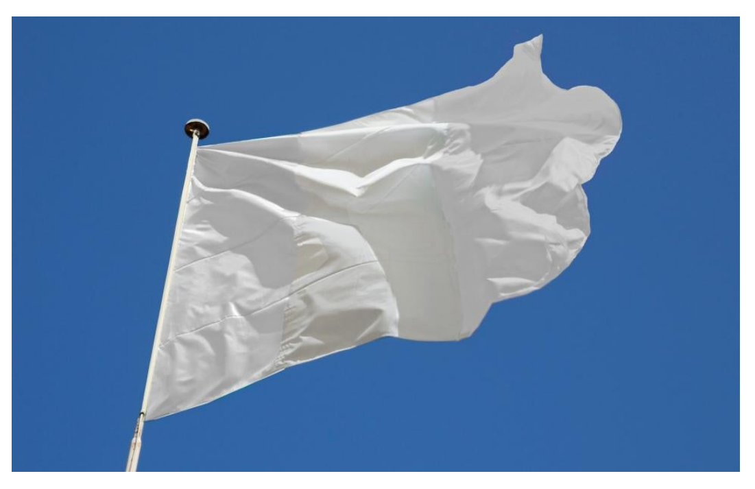
IRS Gets Its Act Together for Forfeiture Rules