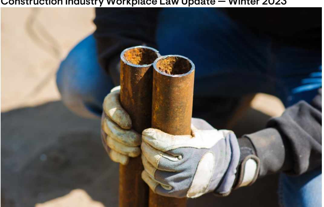
Impact of Labor Board's New Joint-Employer Rule on Construction Industry