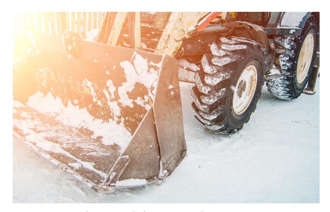
Construction Industry Workplace Law Update — Winter 2023