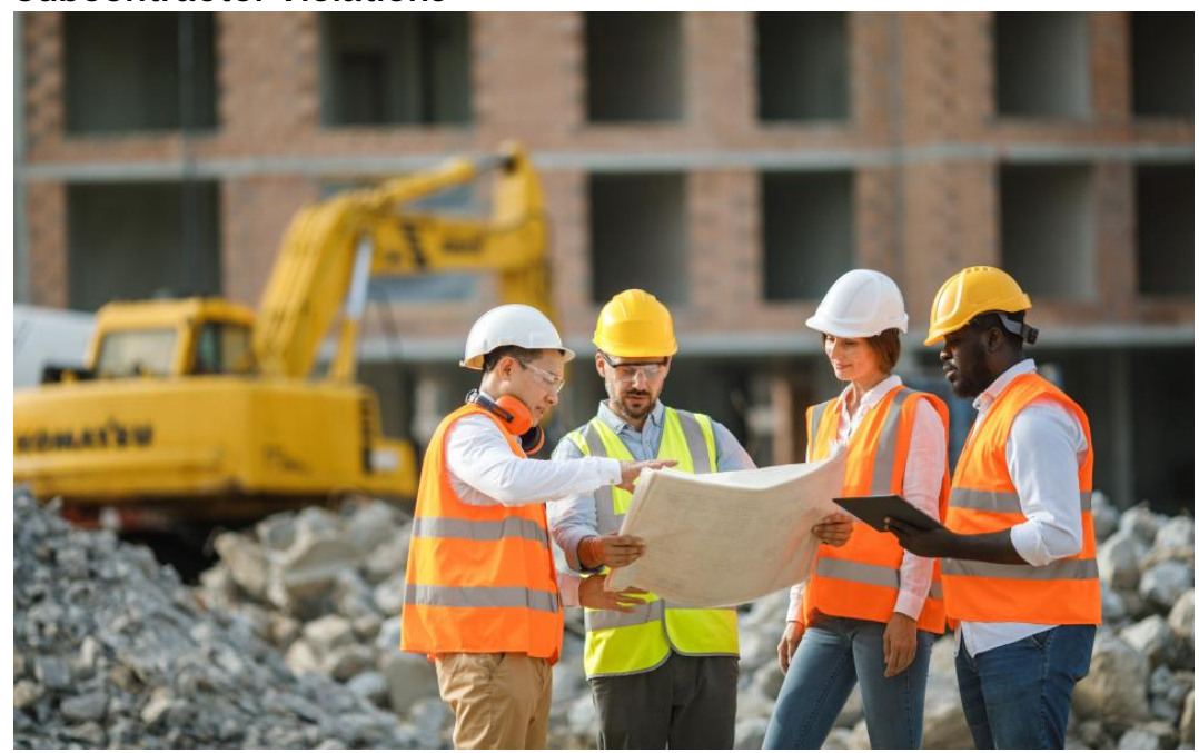
FAR Rule Implements EO-Mandated Use of Project Labor Agreements on Large Federal Construction Projects