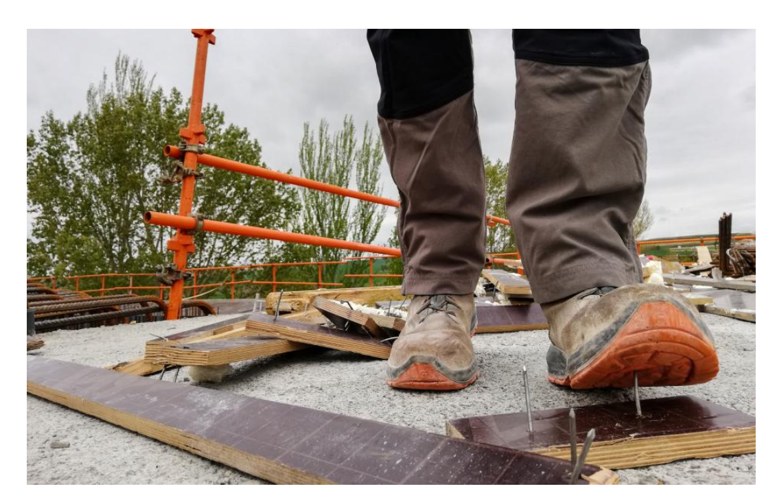
OSHA Continues to Cite Construction General Contractors for Subcontractor Violations