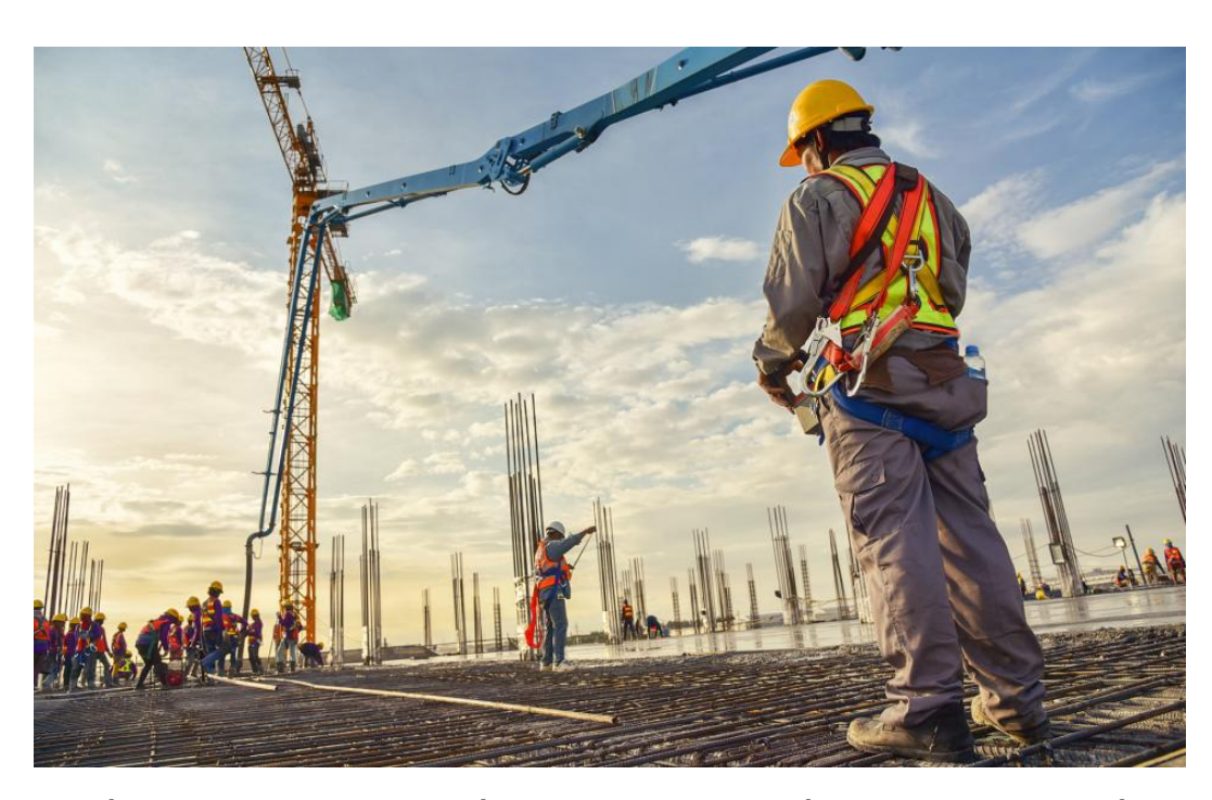
Employee Drug Testing in the Construction Industry: Protecting the Jobsite and Employees