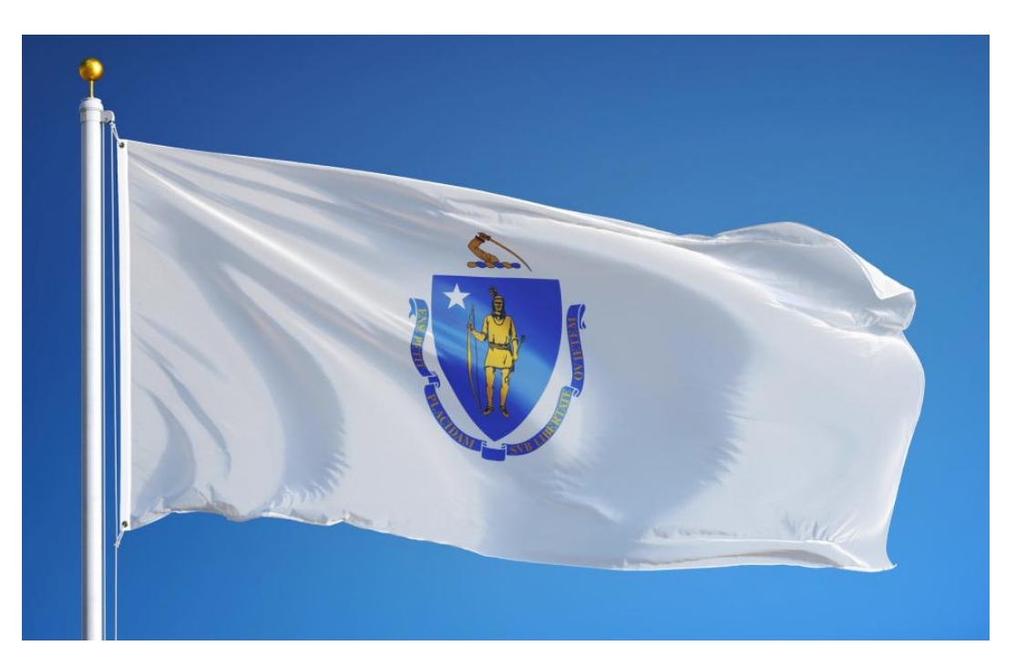
Construction Contractors and Certified Payroll Reports Under Massachusetts Prevailing Wage Law