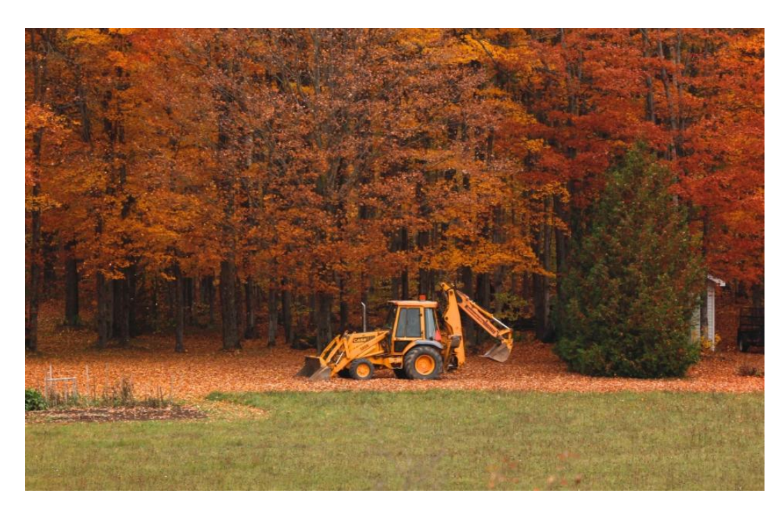
Construction Industry Workplace Law Update - Fall 2023